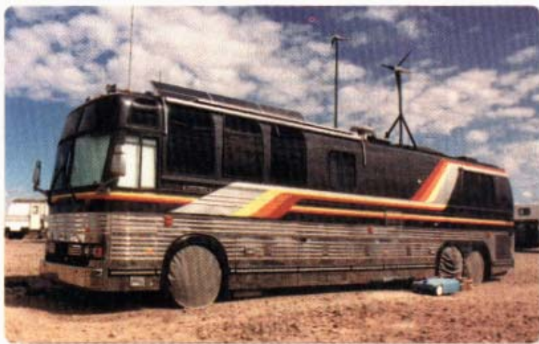
The authors installed wind turbines and solar collectors on their coach's roof to provide them with the power they need to live without hookups (opposite, above).

We purchased eight Siemens M55 (now called SM55) solar modules, rated at 3 amps and 53 watts each, and a 30-amp controller. The solar modules, or panels, generate DC electricity directly from sunlight. The more sunlight they receive, the more electricity they produce. continued