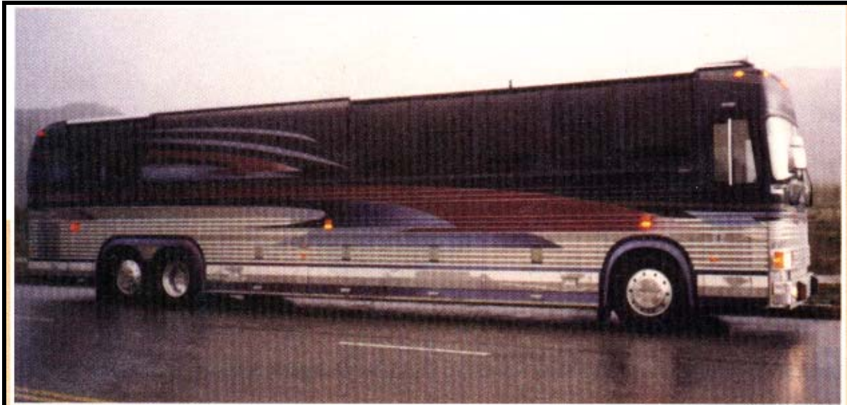
American Carriage's ability to accommodate different needs and tastes is evidenced by varying paint schemes (above and below)