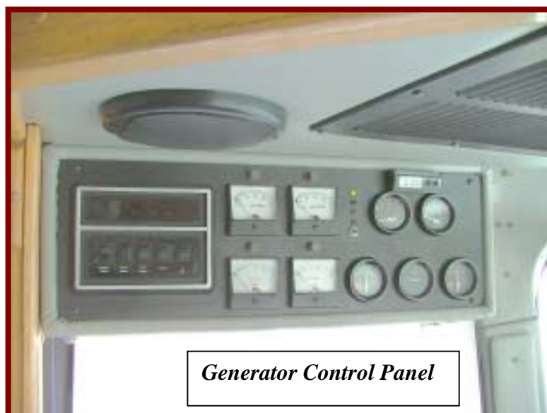
Figure 4 shows the location of circuits for diagnostic LEDs, thermometers, and an ON/OFF latching solenoid for 12V supply. On our coach, a red LED indicates the starter is cranking, a yellow LED indicates the generator is running and AC

Option 5: Use thermometers to monitor the temperature of the generator compartment and the starter case.